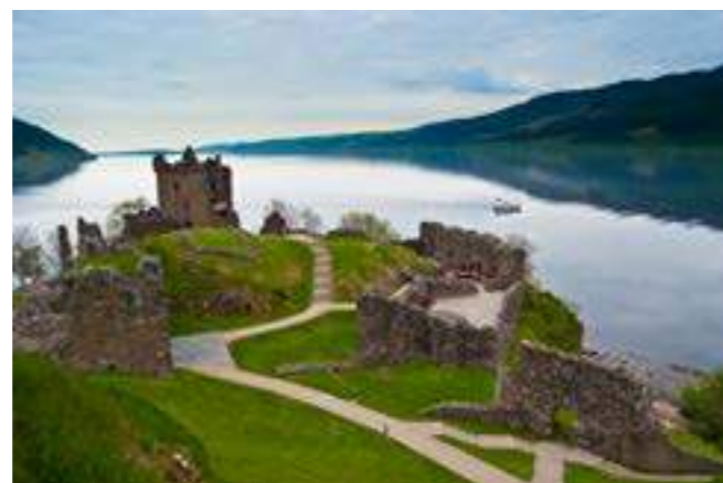
Left: alongside the River Ness in Inverness, a statue of Donald Cameron, the Hogwarts Express, Urquhart Castle