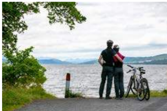
Left: Schiehallion, Rannoch Moor, local walking and cycle paths around Kinloch Rannoch